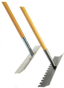
TEXAS PLACER RAKES