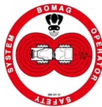
Safe operation Radio/cable remote control with integrated operator protection