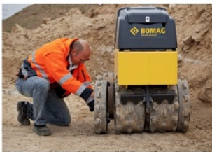
Flexible working widths Original BOMAG drum extensions