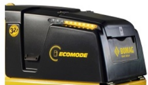
Higher quality, lower costs ECONOMIZER - The compaction display (optional)