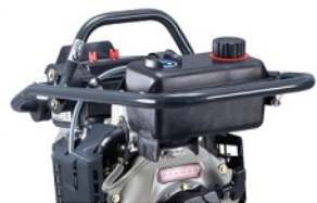
Simple operation Vibration dampened guide handle