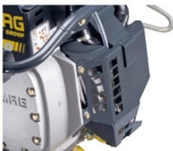
Long lifetime All around engine protection