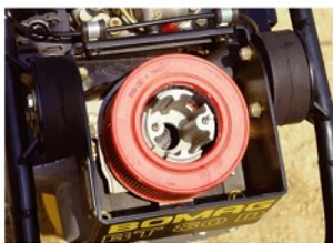
High level of reliability Biggest air filter in the market